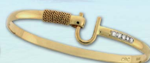
Montesino Diamond Hook Bracelet (Y4DO2) 14k Gold with five 1.7mm diamonds with 0.10 CT TW Wrist sizes 6.5" / 7" / 7.5" 4mm thickness • Retail — See Price List!