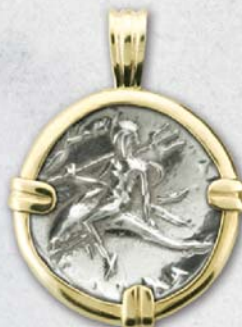
Tarentum Silver Stator Replica Coin Pendant (AC3DOL) (Boy on Dolphin) • Retail $189.00

TARAS, THE YOUNG SON OF POSEIDON WAS SHIP WRECKED BY A RAGING STORM. AS SAVAGE SHARKS ENCIRCLED THE YOUTH, A POD OF ATTACK DOLPHINS ARRIVED AND CARRIED HIM TO SAFETY.