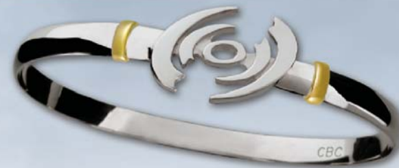
Montesino Hurricane Bracelet (C6HUR) Sterling Silver with 14k Double Bar Wraps Wrist sizes 6.5" / 7" / 7.5" / 8" 6mm thickness • Retail $125.00

Available in 14k Gold without the Diamond Retail — See Price List!