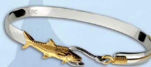
Montesino King Fish Bracelet (KF2C6) Sterling Silver with 14k Swivel/Fish/Line Wrist sizes 6.5" / 7" / 7.5" / 8" / 8.5" 6mm thickness • Retail $ 279.00