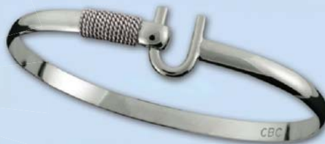
Montesino Hook Bracelet (S4) Sterling Silver • Wrist sizes 6.5" / 7" / 7.5" 4mm thickness • Retail $55.00