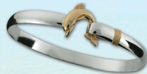
Montesino Dolphin Hook Bracelet (C6DOLHK) Sterling Silver with 14k Wrap/Dolphin Wrist sizes 6.5" / 7" / 7.5" / 8" 6mm thickness • Retail $199.00