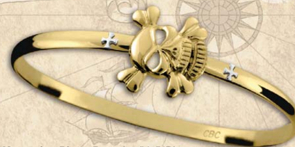
Montesino Pirate Bracelet (Y4PIR) 14k Yellow Gold with White 14k Gold Cross Wrist sizes 6.5" / 7" / 7.5" 4mm thickness • Retail — See Price List!