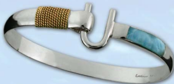
Montesino Larimar Inlay Hook Bracelet (LBC6INHk) Sterling Silver with 14k Wrap Wrist sizes 6.5" / 7" / 7.5" / 8" 6mm thickness • Retail $159.00