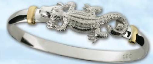
Montesino Gator Bracelet (C6GAT) Sterling Silver with 14k Double Wrap Wrist sizes 6.5" / 7" / 7.5" / 8" 6mm thickness • Retail $129.00