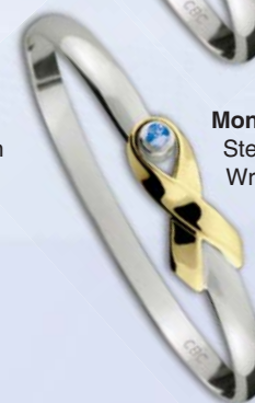
Montesino Awareness Bracelet (C5AWBL) Sterling Silver with Blue Stone & 14k Ribbon Wrist sizes 6.5" / 7" / 7.5" / 8" 5mm thickness • Retail $175.00