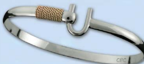
Montesino Hook Bracelet (C4) Sterling Silver with 14k Wrap Wrist sizes 6.5" / 7" / 7.5" 4mm thickness • Retail $89.00