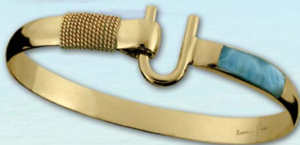
Montesino Larimar Inlay Hook Bracelet (LBY6INHk) 14k Gold • Wrist sizes 6.5" / 7" / 7.5" / 8" 6mm thickness • Retail — See Price List!