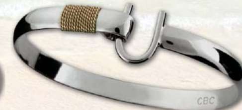
Montesino Hook Bracelet (C6) Sterling Silver with 14k Wrap Wrist sizes 6.5" / 7" / 7.5" / 8" / 8.5" 6mm thickness • Retail $119.00