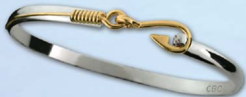
Montesino Fish Hook Bracelet (C4FISH) Sterling Silver with 14k Hook/Swivel/Line Wrist sizes 6.5" / 7" / 7.5" 4mm thickness • Retail $159.00