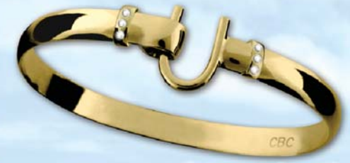
Montesino Double "Diamond Wrap" Hook Bracelet (Y6DW) 14k Gold with six 1.5mm diamonds with 0.09 CT TW Wrist sizes 6.5" / 7" / 7.5" / 8" 6mm thickness • Retail — See Price List!