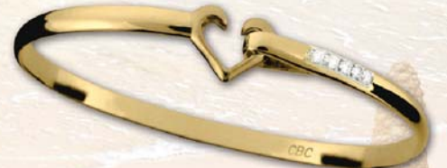
Montesino Diamond Heart Hook Bracelet (Y4HRTD02) 14k Gold with five 1.7mm diamonds 0.10 CT TW Wrist sizes 6.5" / 7" / 7.5" 4mm thickness Retail — See Price List!