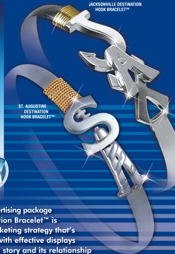
JACKSONVILLE DESTINATION HOOK BRACELET™