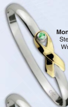
Montesino Awareness Bracelet (C5AWGR) Sterling Silver with Green Stone & 14k Ribbon Wrist sizes 6.5" / 7" / 7.5" / 8" 5mm thickness • Retail $175.00