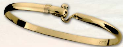
Montesino Lovers Loop Bracelet (Y4LOVE) 14k Gold Wrist sizes 6.5" / 7" / 7.5" 4mm thickness • Retail — See Price List!