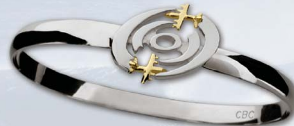
Montesino Hurricane Hunter Bracelet (C6HURH) Sterling Silver with 14k Hunter Planes Wrist sizes 6.5" / 7" / 7.5" / 8" / 8.5" 6mm thickness • Retail $109.00