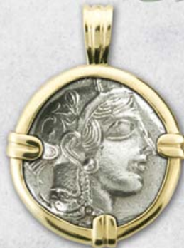
Attica Tetradrachm Replica Coin Pendant (AC1HEA) (Head of Athena) • Retail $225.00

AS ROME CONQUERED THE WESTERN WORLD, THE SILVER DENARIUS BECAME THE MONETARY STANDARD. THE DENARIUS REPRESENTED A DAY'S PAY FOR A ROMAN SOLDIER.