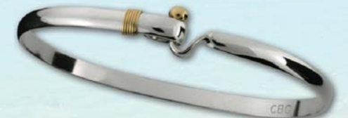
Montesino Lovers Loop Bracelet (C4LOVE) Sterling Silver with 14k Wrap/Ball Wrist sizes 6.5" / 7" / 7.5" 4mm thickness • Retail $89.00