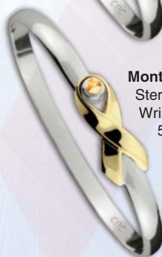
Montesino Awareness Bracelet (C5AWYE) Sterling Silver with Yellow Stone & 14k Ribbon Wrist sizes 6.5" / 7" / 7.5" / 8" 5mm thickness • Retail $175.00