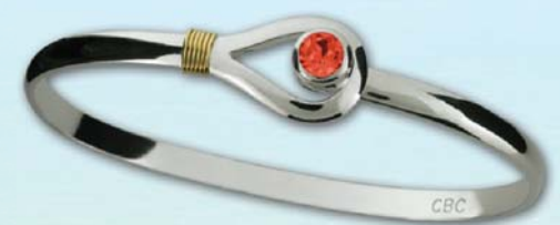
Montesino Unity Garnet Bracelet (C4UNYGAR) Sterling Silver with 14k Wrap (5mm round Red Garnet) Wrist sizes 6.5" / 7" / 7.5" 4mm thickness • Retail $95.00

This Petroglyph symbol is found on pre-Columbian rocks throughout the Caribbean Islands as well as other locations and has been forged in precious metals by native Caribbean craftsmen as a tribute to those ancient cultures.