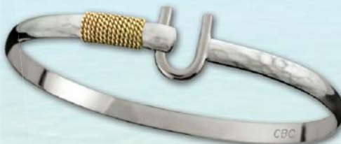
Montesino Hammered Hook Bracelet (C4HAM) Sterling Silver (Hammered) with 14k Wrap Wrist sizes 6.5" / 7" / 7.5" 4mm thickness • Retail $95.00