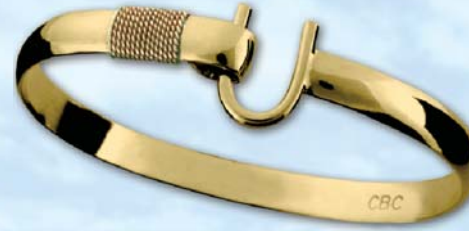
Montesino Hook Bracelet (Y6L) 14k Gold • Wrist sizes 6.5" / 7" / 7.5" / 8" 6mm thickness • Retail — See Price List!