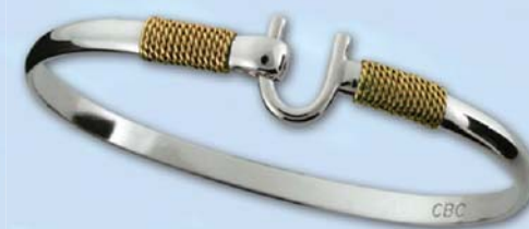
Montesino Hook Bracelet (C42W) Sterling Silver with 14k Double Wrap Wrist sizes 6.5" / 7" / 7.5" 4mm thickness • Retail $125.00