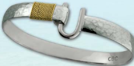
Montesino Hammered Hook Bracelet (C8HAM) Sterling Silver (Hammered) with 14k wrap Wrist sizes 6.5" / 7" / 7.5" / 8.0" / 8.5" 8mm thickness • Retail $145.00