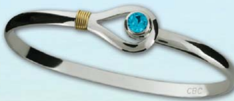
Montesino Unity Blue Topaz Bracelet (C4UNYTOP) Sterling Silver with 14k Wrap (5mm round Blue Topaz) Wrist sizes 6.5" / 7" / 7.5" 4mm thickness • Retail $95.00