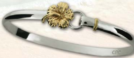
Montesino Hibiscus Bracelet (C4HIB) Sterling Silver with 14k Wrap/Hibiscus Wrist sizes 6.5" / 7" / 7.5" 4mm thickness • Retail $125.00