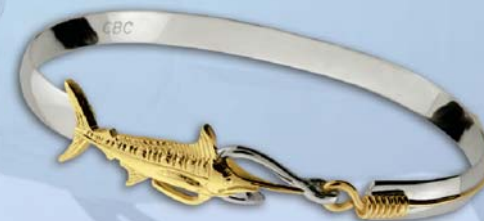
Montesino Marlin Bracelet (ML2C6) Sterling Silver with 14k Fish/Swivel/Line Wrist sizes 6.5" / 7" / 7.5" / 8" / 8.5" 6mm thickness • Retail $279.00