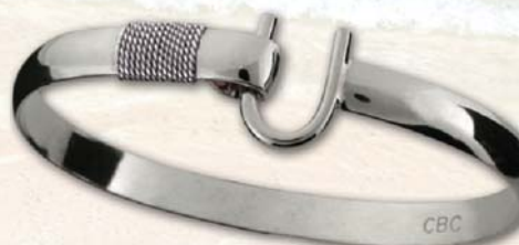
Montesino Hook Bracelet (S6) Sterling Silver • Wrist sizes 6.5" / 7" / 7.5" / 8" 6mm thickness • Retail $75.00