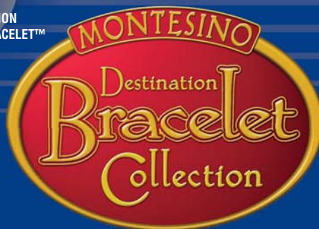
KEY WEST DESTINATION HOOK BRACELET™