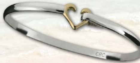
Montesino Heart Hook Bracelet (C4HRTHK) Sterling Silver with 14k Wrap/Heart Wrist sizes 6.5" / 7" / 7.5" 4mm thickness • Retail $109.00