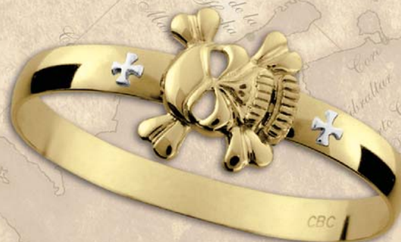
Montesino Pirate Bracelet (Y8PIR) 14k Gold with White Gold Cross Wrist sizes 7" / 7.5" / 8" / 8.5" 8mm thickness • Retail — See Price List!