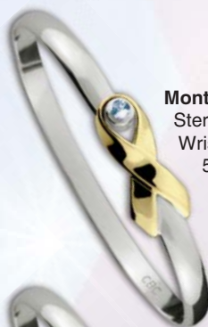
Montesino Awareness Bracelet (C5AWWH) Sterling Silver with White Stone & 14k Ribbon Wrist sizes 6.5" / 7" / 7.5" / 8" 5mm thickness • Retail $175.00