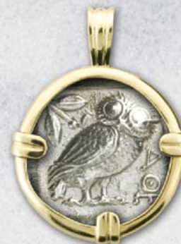
Attica Tetradrachm Replica Coin Pendant (AC2OWL) (Owl Standing) • Retail $225.00

INTENDED FOR WIDE CIRCULATION, "OWLS" IS CONSIDERED ONE OF THE MOST TREASURED COINS OF COLLECTORS WORLDWIDE.