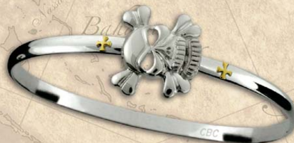
Montesino Pirate Bracelet (C4PIR) Sterling Silver with 14k Cross • Wrist sizes 6.5" / 7" / 7.5" 4mm thickness • Retail $105.00

The high seas, the open road, unexplored terrain... all of these thoughts of freedom from our daily lives are evoked with this simple but powerful symbol. For adventurers of today, the Montesino Pirate Hook Bracelet™ will tell the world that you are in control of your free-time destiny!