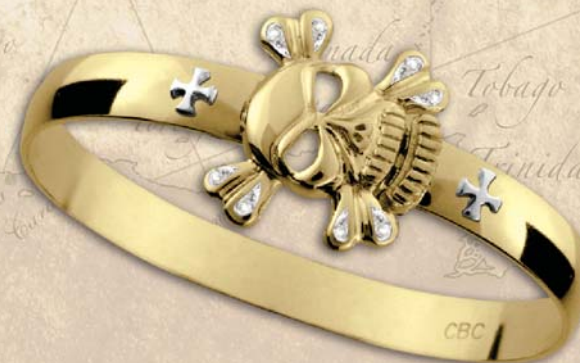
Montesino Diamond Pirate Bracelet (Y8PIRD) 14k Yellow Gold with White 14k Gold Cross & eight 2mm Diamonds 0.24 CT TW Wrist sizes 7" / 7.5" / 8" / 8.5" 8mm thickness • Retail — See Price List!