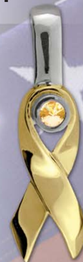
Support Our Troops

Please check our website for a complete list of Awareness Hook Bracelets Available.