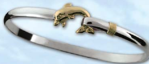
Montesino Dolphin Hook Bracelet (C4DOLHK) Sterling Silver with 14k Wrap/Dolphin Wrist sizes 6.5" / 7" / 7.5" 4mm thickness • Retail $155.00