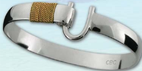
Montesino Hook Bracelet (C8) Sterling Silver with 14k Wrap Wrist sizes 6.5" / 7" / 7.5" / 8" / 8.5" 8mm thickness • Retail $139.00