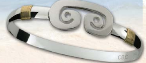
Montesino Petroglyph Bracelet (C6PET) Sterling Silver with 14k Double Wrap Wrist sizes 6.5" / 7" / 7.5" / 8" / 8.5" 6mm thickness • Retail $115.00