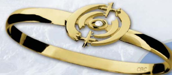
Montesino Diamond Hurricane Hunter Bracelet (Y6HURHD) 14k Gold with one 3mm Diamond 0.10 CT TW Wrist sizes 6.5" / 7" / 7.5" / 8" 6mm thickness • Retail — See Price List!

Available in 14k Gold without the Diamond Retail — See Price List!