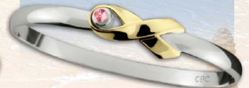
Montesino Awareness Bracelet (C5AWPI) Sterling Silver with Pink Stone & 14k Ribbon Wrist sizes 6.5" / 7" / 7.5" / 8" 5mm thickness • Retail $175.00

SEE PAGE 16 FOR MORE AWARENESS BRACELET STYLES!