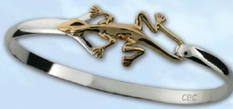
Montesino Lizard Bracelet (C4LIZ) Sterling Silver with 14k Lizard Wrist sizes 6.5" / 7" / 7.5" 4mm thickness • Retail $175.00