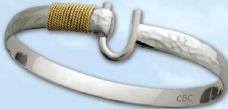
Montesino Hammered Hook Bracelet (C6HAM) Sterling Silver (Hammered) with 14k wrap Wrist sizes 6.5" / 7" / 7.5" / 8.0" / 8.5" 6mm thickness • Retail $125.00