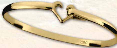
Montesino Heart Hook Bracelet (Y4HRTHK) 14k Gold • Wrist sizes 6.5" / 7" / 7.5" 4mm thickness • Retail — See Price List!