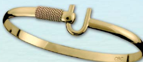
Montesino Hook Bracelet (Y4L) 14k Gold • Wrist sizes 6.5" / 7" / 7.5" 4mm thickness • Retail — See Price List!