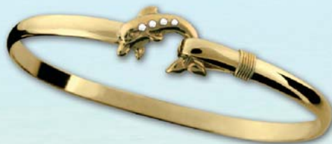
Montesino Diamond Dolphin Hook Bracelet (Y4DOLHKD) 14k Gold with four 1.5mm diamonds with 0.06 CT TW Wrist sizes 6.5" / 7" / 7.5" 4mm thickness • Retail — See Price List!