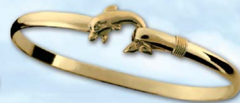
Montesino Dolphin Hook Bracelet (Y4DOLHK) 14k Gold • Wrist sizes 6.5" / 7" / 7.5" 4mm thickness • Retail — See Price List!