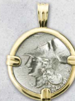
Corinthian Silver Stated Replica Coin Pendant (AC6ATH) (Head of Athena2) Retail $179.00

THE GODDESS ATHENA WEARING HER CORINTHIAN BATTLE HELMET; ATHENA, THE GODDESS OF WISDOM AND WAR, WAS BORN FULLY ARMORED FROM HER FATHER ZEUS, AND WAS ENTRUSTED WITH HIS HORRIFIC THUNDERBOLT.