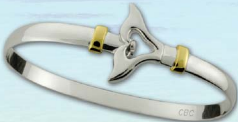
Montesino Whale Tail Bracelet (C6WTHRT) Sterling Silver with 14k Wrap Wrist sizes 6.5" / 7" / 7.5" / 8" / 8.5" 6mm thickness • Retail $115.00