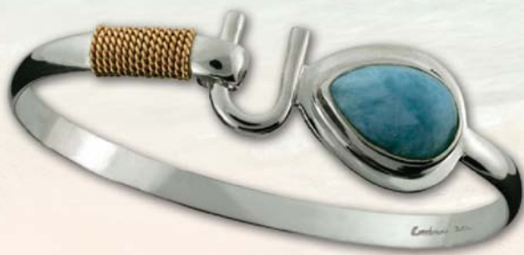
Montesino Larimar Hook Bracelet (LBC4CBHK) Sterling Silver with 14k Wrap Wrist sizes 6.5" / 7" / 7.5" 4mm thickness • Retail $109.00