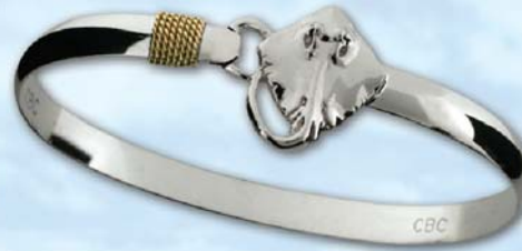
Montesino Sting Ray Bracelet (C6SR) Sterling Silver with 14k Wrap Wrist sizes 6.5" / 7" / 7.5" / 8" / 8.5" 6mm thickness • Retail $99.00