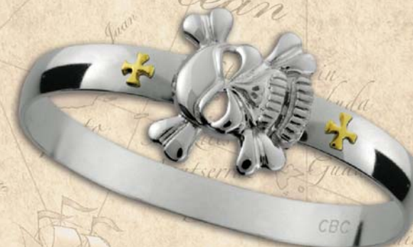
Montesino Pirate Bracelet (C8PIR) Sterling Silver with 14k Cross • Wrist sizes 7" / 7.5" / 8" / 8.5" 8mm thickness • Retail $139.00