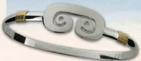
Montesino Petroglyph Bracelet (C4PET) Sterling Silver with 14k Double Wrap Wrist sizes 6.5" / 7" / 7.5" 4mm thickness • Retail $85.00

This Petroglyph symbol is found on pre-Columbian rocks throughout the Caribbean Islands as well as other locations and has been forged in precious metals by native Caribbean craftsmen as a tribute to those ancient cultures.