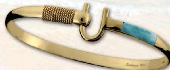
Montesino Larimar Inlay Hook Bracelet (LBY4INHK) 14k Gold • Wrist sizes 6.5" / 7" / 7.5" 4mm thickness • Retail — See Price List!