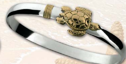
Montesino Turtle Bracelet (C6TUR) Sterling Silver with 14k Wrap/Turtle Wrist sizes 6.5" / 7" / 7.5" / 8" 6mm thickness • Retail $225.00