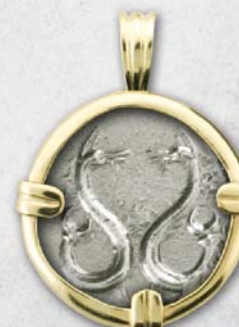
Itanion Replica Coin Pendant (AC4SEA) (Sea Monster) • Retail $205.00