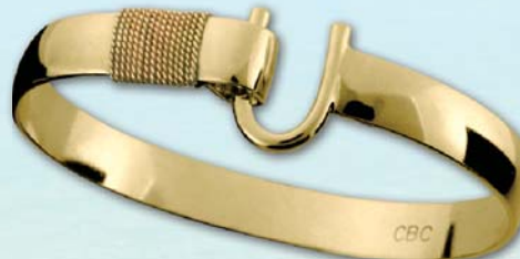
Montesino Hook Bracelet (Y8L) 14k Gold • Wrist sizes 7" / 7.5" / 8" / 8.5" 8mm thickness • Retail — See Price List!