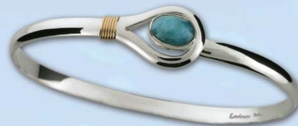
Caribbean Larimar Unity Bracelet (LBC4UNY) Sterling Silver with 14k Wrap Wrist sizes 6.5" / 7" / 7.5" 4mm thickness • Retail $95.00