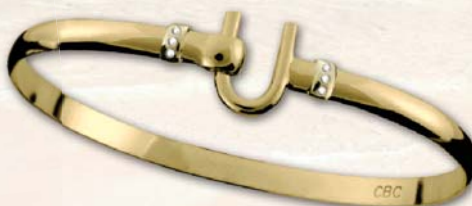
Montesino Double "Diamond Wrap" Hook Bracelet (Y4DW) 14k Gold with six 1.2mm diamonds 0.05 CT TW Wrist sizes 6.5" / 7" / 7.5" 4mm thickness • Retail — See Price List!