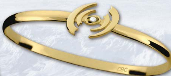
Montesino Diamond Hurricane Bracelet (Y4HURD) 14k Gold with one 2mm Diamond 0.03 CT TW Wrist sizes 6.5" / 7" / 7.5" 4mm thickness • Retail — See Price List!

Most of us accept the threat of dangerous hurricanes as a part of living in a tropical location. It could even be said that those who live in harm's way are just as brave as those who work in harm's way — the aviators and scientists who fly directly into hurricanes in order to study them. Wear this symbol of fortitude and daring with the original Hurricane and Hurricane Hunter Bracelet.™