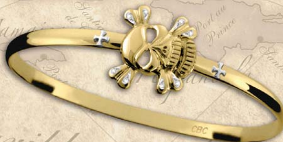
Montesino Diamond Pirate Bracelet (Y4PIRD) 14k Yellow Gold with White 14k Gold Cross & eight 1.5mm Diamonds 0.12 CT TW Wrist sizes 6.5" / 7" / 7.5" 4mm thickness • Retail — See Price List!