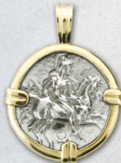
Tarentum Silver Stator Replica Coin Pendant (AC5HOR) (Naked Horseman) • Retail $189.00

AN IMAGE OF A NUDE HORSEMAN'S VICTORIOUS PERFORMANCE IN A CLASSIC ATHLETIC CONTEST.