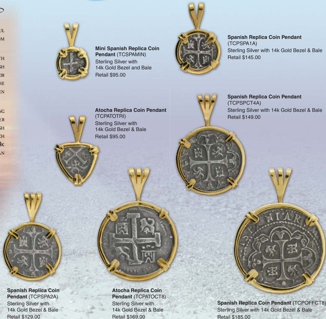
Mini Spanish Replica Coin Pendant (TCSPAMIN)

ARTICLES ARE CAST REPLICAS CONTAINING A PERCENTAGE OF ORIGINAL SILVER COINS SALVAGED FROM SPANISH GALLEON WRECK SITES. EACH COIN IS HAND BEZELED IN 14K GOLD BY NATIVE CARIBBEAN CRAFTSMEN.