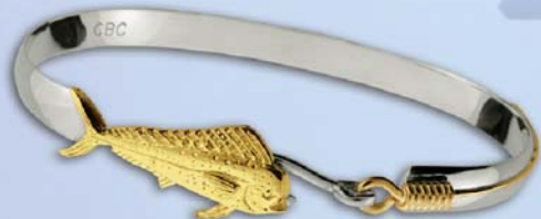
Montesino Mahi Mahi Bracelet (MM2C6) Sterling Silver with 14k Fish/Swivel/Line Wrist sizes 6.5" / 7" / 7.5" / 8" / 8.5" 6mm thickness • Retail $279.00