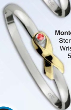
Montesino Awareness Bracelet (C5AWRE) Sterling Silver with Red Stone & 14k Ribbon Wrist sizes 6.5" / 7" / 7.5" / 8" 5mm thickness • Retail $175.00