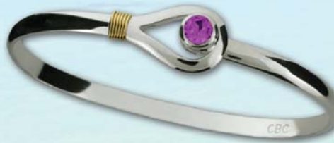
Montesino Unity Amethyst Bracelet (C4UNYAM) Sterling Silver with 14k Wrap (5mm round Purple Amethyst) Wrist sizes 6.5" / 7" / 7.5" 4mm thickness • Retail $95.00