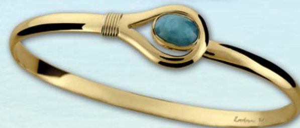
Caribbean Larimar Unity Bracelet (LBY4UNY) 14k Gold • Wrist sizes 6.5" / 7" / 7.5" 4mm thickness • Retail — See Price List!