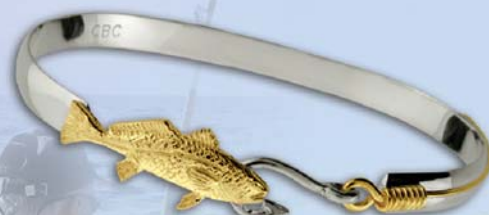
Montesino Red Fish Bracelet (RF2C6) Sterling Silver with 14k Fish/Swivel/Line Wrist sizes 6.5" / 7" / 7.5" / 8" / 8.5" 6mm thickness • Retail $279.00