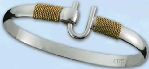
Montesino Hook Bracelet (C62W) Sterling Silver with 14k Double Wrap Wrist sizes 6.5" / 7" / 7.5" / 8" / 8.5" 6mm thickness • Retail $165.00