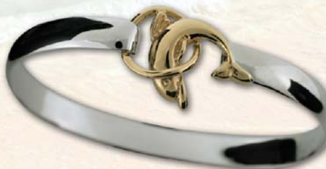
Montesino Dolphin Circle Bracelet (C6DOLCIR) Sterling Silver with 14k Wrap/Dolphin/Circle Wrist sizes 6.5" / 7" / 7.5" 6mm thickness • Retail $195.00