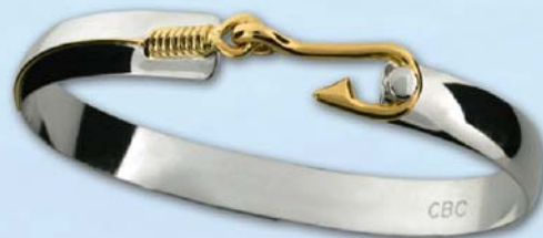
Montesino Fish Hook Bracelet (C8FISH) Sterling Silver with 14k Hook/Swivel/Line Wrist sizes 7" / 7.5" / 8" / 8.5" 8mm thickness • Retail $205.00