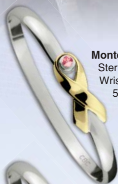
Montesino Awareness Bracelet (C5AWPI) Sterling Silver with Pink Stone & 14k Ribbon Wrist sizes 6.5" / 7" / 7.5" / 8" 5mm thickness • Retail $175.00