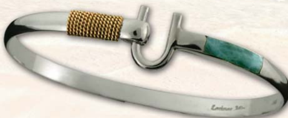
Montesino Larimar Inlay Hook Bracelet (LBC4INHK) Sterling Silver with 14k Wrap Wrist sizes 6.5" / 7" / 7.5" 4mm thickness • Retail $139.00