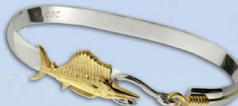
Montesino Sail Fish Bracelet (SF2C6) Sterling Silver with 14k Fish/Swivel/Line Wrist sizes 6.5" / 7" / 7.5" / 8" / 8.5" 6mm thickness • Retail $309.00