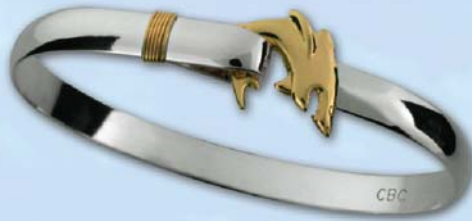
Montesino Shark Hook Bracelet (C6SHAHK) Sterling Silver with 14k Wrap/Shark Wrist sizes 6.5" / 7" / 7.5" / 8" / 8.5" 6mm thickness • Retail $159.00